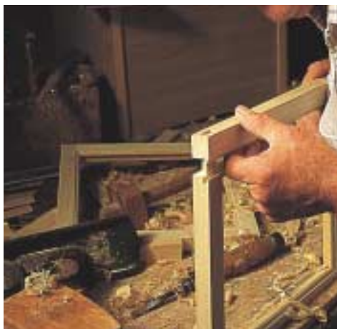
Above: The solid doors and their surrounds are cut from a single sheet of real oak veneer so the grain runs through, providing that classic Carlight style.