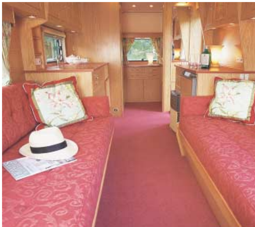
Above: The Carlight Commander 162EW. Below: Waste bin and pull out stool in the 162EW.

Dovetailed timber drawers, morticed and tenoned joints, and locker doors cut from a single piece of veneer so the grain of the oak runs through, are hallmarks of skills seldom seen today. However, for over 60 years now, we have been crafting caravans in this manner.