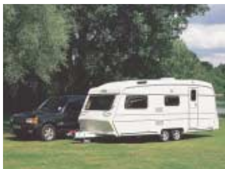
Below: The Carlight Commander 182.

Our unique water management system provides probably the neatest and yet simplest solution to fresh and waste water management available. This enables the caravan to be operated from either the mains fresh water supply or alternatively from the on-board watertank via the wheeled fresh water container. The fresh and waste water containers store conveniently in the rear boot together with the waste hoses etc. which keeps the main interior of the caravan clean and tidy.